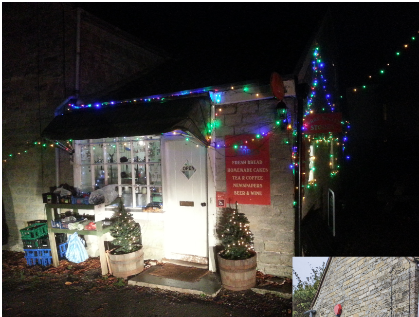
Christmas past happy memories