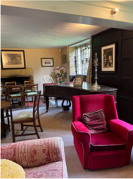
The Elizabethan Panelled Room

In addition to the ever-popular strawberry jam, we can now offer a wide variety of preserves made from fruits grown all around the village.